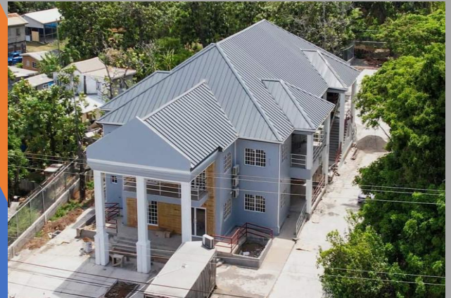
Temporary Parliament Building, Calliaqua