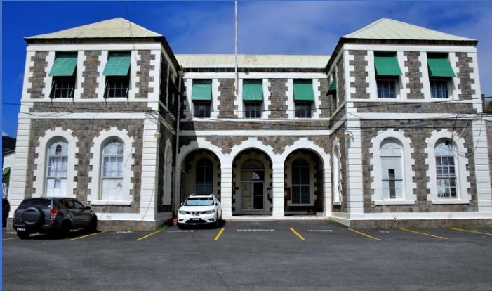
The Court House Building, White Chapel Road, Kingstown

The final sitting of the House of Assembly, at White Chapel Road, Kingstown was held on the 1 st June 2023. This sitting welcomed Parliamentarians both past and present as we said farewell in a bitter sweet moment to a building in excess of 200 years old, and which served the legislature for several decades.