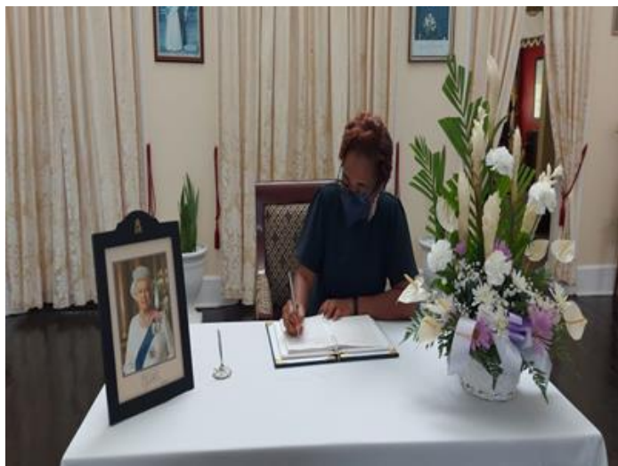
SIGNING THE BOOK OF CONDOLENCE